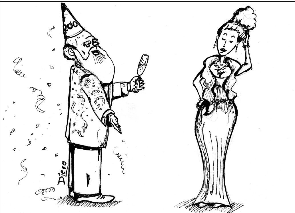
MY DEAR MOTHER EARTH, FOR SOMEONE 4.5 BILLION YEARS OLD, I DARE SAY YOU DON'T LOOK A DAY OVER 6000.