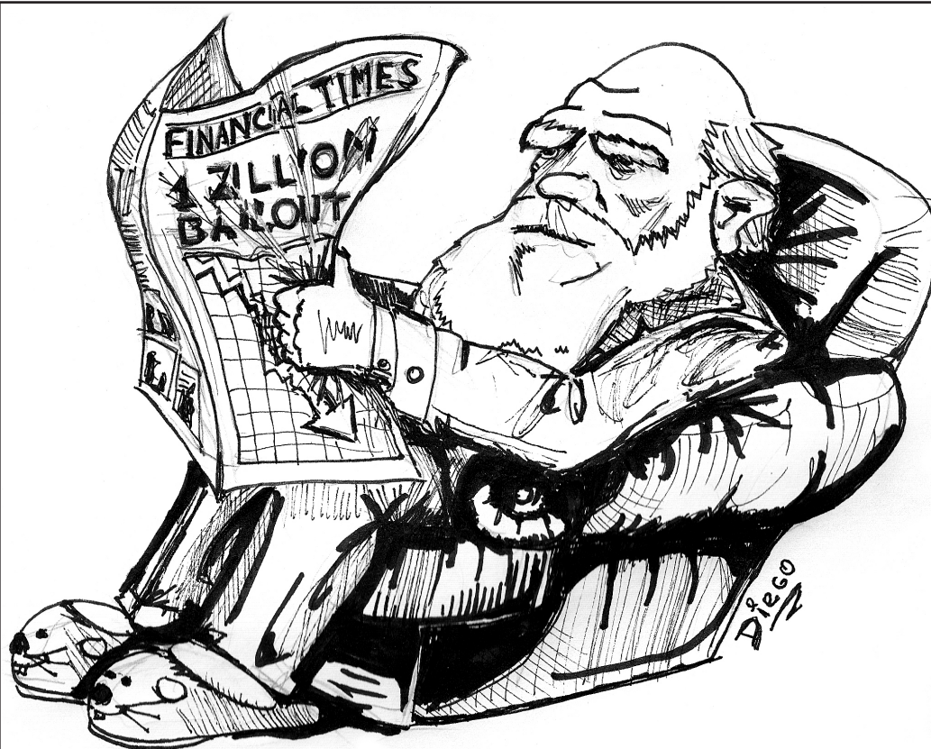
SURVIVAL OF THE FITTEST, MY ASS! AND THEY SAY MY WORK IS 'JUST A THEORY'.