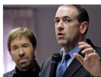
Chuck Norris Now Available to Stand Behind You at Press Conferences

their habitats has significantly disrupted the natural stork life cycle, and paradoxically, threatened our very existence. I've even heard of tales — God help us — of humans hunting and actually eating storks! If these cannibals aren't doing the devil's work on Earth, I don't know who is, except maybe the devil, who is among us, and is named Barak Obama.