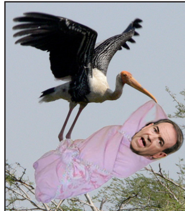
Unless We Act Now, Its Huck-a-bye, Baby

And its not just the birds that are in trouble. Evidently North American honey bee populations are also declining. You see, its all connected. I once had an atheist friend of mine — yes, some of my best friends are atheists — ask me pointedly how bees or birds themselves made babies. I can't tell you how hard it was to hold back my pity for the young woman as I patiently explained to her that they simply used very small storks. Despite her ignorance of the ways of the divine, the aha experience I witnessed in her eyes as she finally saw the truth made it all worth it.