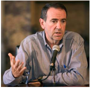
By Mike Huckabee