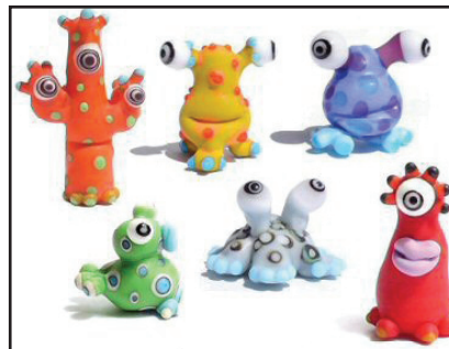
Harvard Researchers Identify Deadliest COOTIES Strains of 2007 (electron microscopy, magnification x 4 million)

The recent media attention on the COOTIES virus, the Complex Organic Olfactory Total Internal Ecccchhhh Syndrome (also know as COV-578), has sparked a flurry of medical research, much of it conducted here at Harvard. The work has resulted in a promising trial version of the COOTIES vaccine, COOVAX™ which consists of a base shot and 12 booster shots (which must be taken while sitting in a booster seat) administered bimonthly for 24 months, along with a complicated cocktail involving 2 circles and 2 dots. The cost is only $129.95 per shot, "a bargain when your life is on the line", according to HUHS spokesperson Maureen Astra-Zeneca. Following a recent internal Harvard report, the school plans to conduct phase III vaccine clinical trials for COOVAX™ locally. Bloom noted, "We first considered advertising on the T like we usually do for these things, but after thinking it over in our weekly closed door session, I just said fuck it, let's start at Cabot house!"