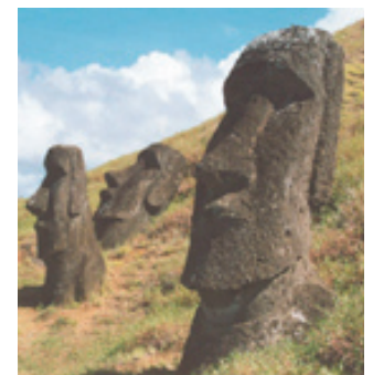
Can someone tell me again why we agreed to this?