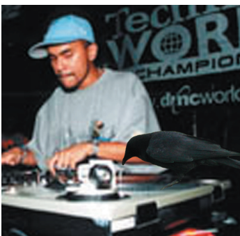
Area DJ Embarrassingly Outscratched by Local Crow