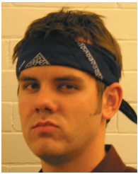
by Ice Man