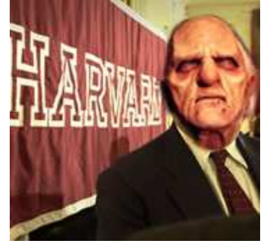
One of one undead Professors in the Harvard Physics Department, just a few key papers shy of tenure. Or at least that's what the department chair has said since 1985.

"We must consider the possibility that there are fewer undead professors at Harvard because of intrinsic biological differences. I mean, seriously, the living simply have more time to devote to academic research and consistently score higher on standardized math and science tests than the deceased. I could be completely wrong here, but studies of identical heads severed at birth seem to clearly bear this thesis out. Listen, I sincerely wish the problem was based on socialization alone, and of course, I fundamentally respect and admire the undead on the faculty here – especially in light of all the years of social injustice and oppression they've had to endure – but clearly zombies have other concerns on their minds, for example, their innate drive to consume the flesh of living, tenured science professors who are at least 4-5 standard deviations above the mean."